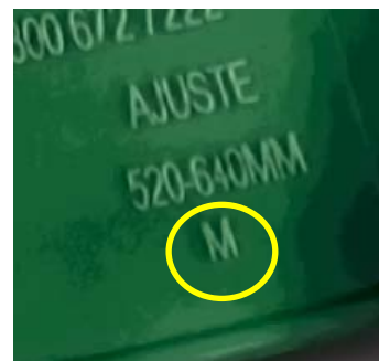
Figure 3 – Medium Size