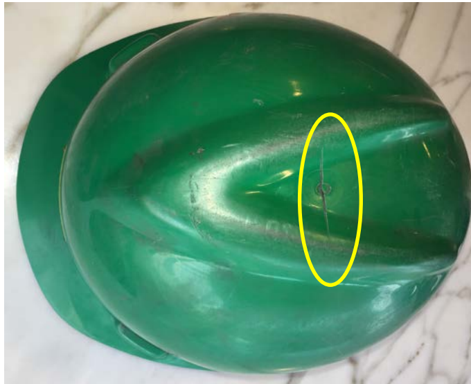
Figure 1 – Cracking in a Green Colored MSA V-Gard Protective Cap

MSA is issuing this Safety Advisory to inform you that MSA has received field reports that some green colored MSA V-Gard Protective Caps are cracking. The cracking occurs at the top of the cap, as shown in Figure 1, and is not caused by an impact to the cap. MSA has confirmed that the cause of the cracking is limited to green colored, medium size MSA V-Gard Protective Caps and that corrections have been made to prevent recurrence.